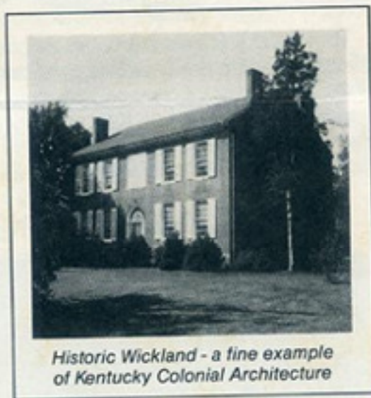
Historic Wickland - a fine example of Kentucky Colonial Architecture